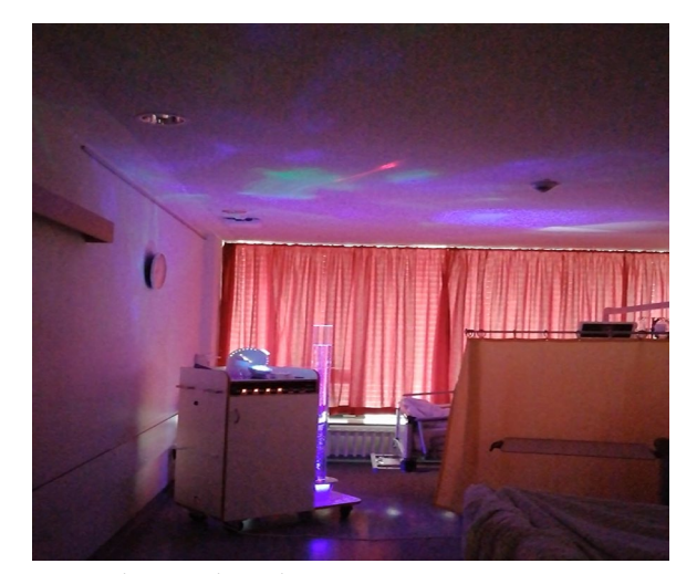
Fig. 1 Multisensorial stimulation treatment

The exploratory statistical analysis was performed using the statistical programming environment R. Continuous variables are presented with median and interquartile range (IQR). A normal distribution of the continuous variables was not present. Categorical variables are shown as numbers and percentages (%). The differences between intervention and control group regarding the characteristics were analyzed using the non-parametric Wilcoxon rank-sum test for continuous variables and the Fisher's exact test was computed to check for independence for categorical variables.